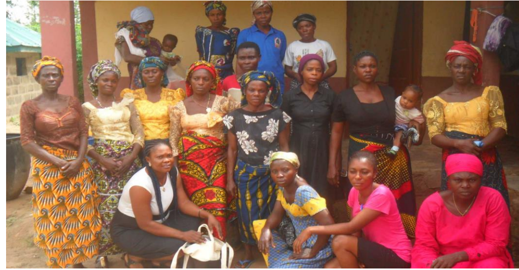
The group in Elugwu Ettam was able to empower four more women in September.