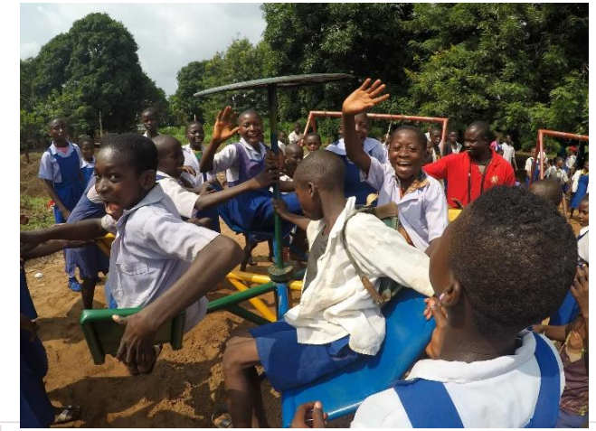
Akparata School new playground