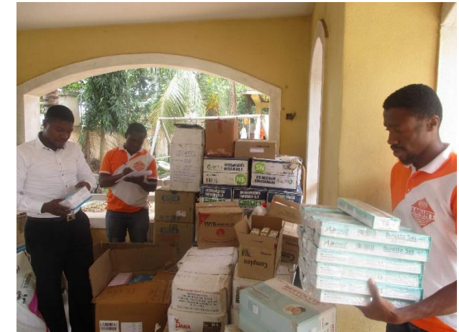
AMURT staff organizing drugs and medical supplies