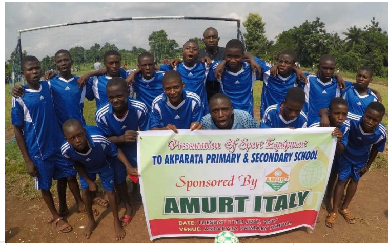
Akparata Youth Football Team