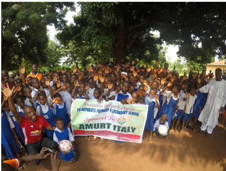
Children from Akparata Primary School thanks AMURT Italy

AMURT in Italy has sponsored children's sports programs in several countries including Togo and Burkina Faso. This summer Akparata Primary and Secondary school was lucky to benefit. The AMURT assisted Akparata Health Center is located on the same grounds. With funds from AMURT Italy, we were able to build one soccer field, one basketball court and two volley ball courts with balls, pumps, whistles and four full team set of jerseys and shorts for the football teams. We also installed a playground for the primary school children with two swing sets, two slides and two merry-go-rounds. Everything was handed over to the community and the school on 11 th July.