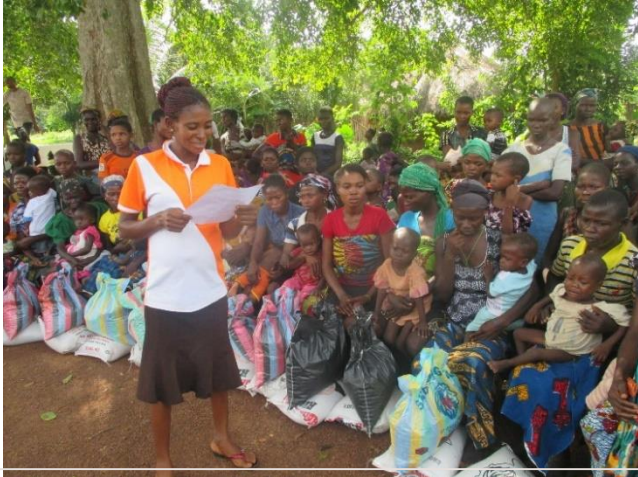
. Food aid to families