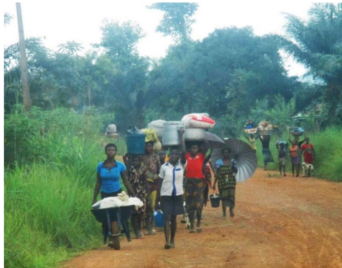
Fleeing families was a common sight in July and August

The communal conflict that broke out in January and spread to Offia Oji Project area in May, escalated during July and August, before the situation improved in September. The violence in July saw over 450 family homes burnt in the frontline villages. On 15 th August Offia Oji Health Center was attacked and burnt. During most of the period the Offia Oji Health Center operated from classrooms at Egwuagu Secondary School. During the height of the crisis in July and August more than 1200 families were forced to flee the violence. They settled in villages in Offia Oji and Ephuenyim project areas. AMURT conducted enumeration of all the displaced families in the project area and document 8354 internally displaced people from 1236 families, nearly all famers who depend on their farms for food and income. Disease, hunger and malnutrition became rampant. AMURT started a program with free medical care for displaced children in Ephuenyim Health Center and Egwuagu temporary site. Health workers visited every home to assess the IDP children. Food aid for the most needy families were distributed on the basis of the assessment.