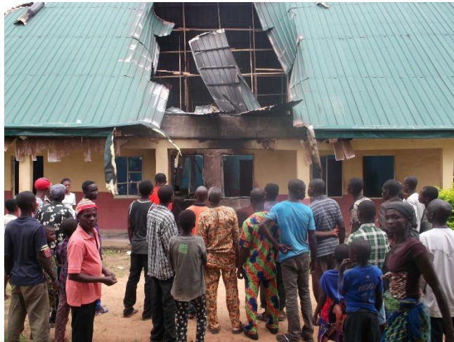
Offia Oji Health Center was burnt on 15 August