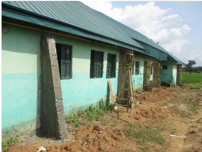
The community provided the labour for the reinforcement pillars of the structure.

In accordance with the MOU with Ebonyi State Govt., AMURT started the work at Mgbalukwu in Ogbeagu Ward, Isu community in Onicha LGA. The government has posted six health workers. AMURT has provided materials for repairs and structural reinforcements for a health center constructed in 2013, but never used. The community has taken responsibility for all the labour. AMURT has already held meetings in every village in Ogbeagu ward and completed the enumeration of women of child bearing age, the election of maternal health promoters, drilling of borehole for the health center.