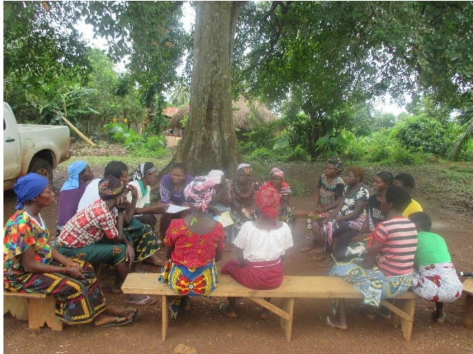
Monthly meeting of Offia Oji group.