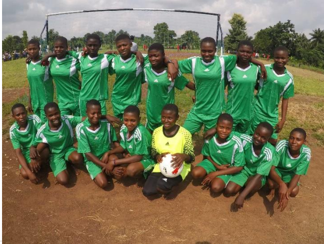
Akparata Girls Football Team.