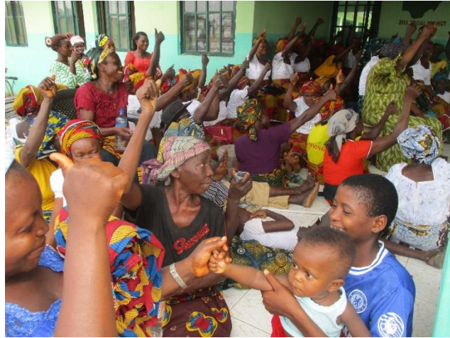
Community meeting at Mgbalukwu Health Center