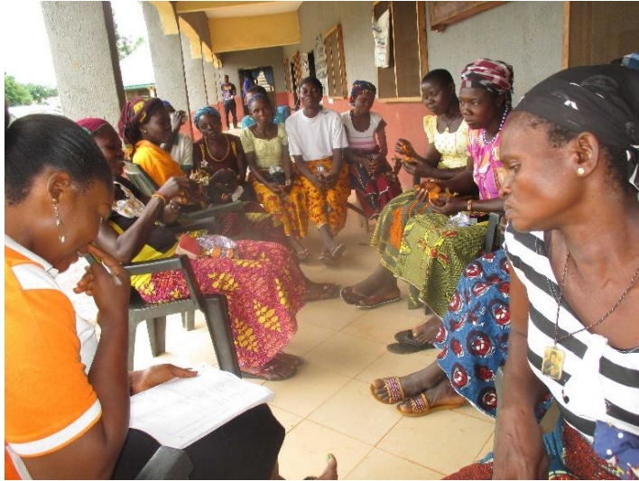
Four more women empowered in the Gmelina group