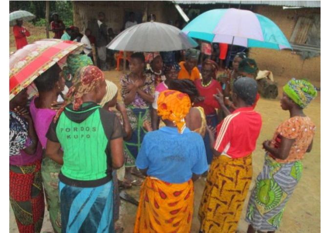
Women at Ojigbe electing maternal health promoters.