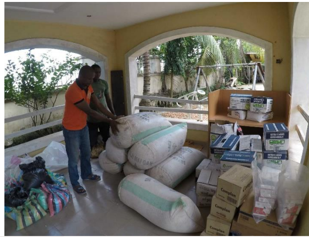
Food aid prepared at the AMURT office