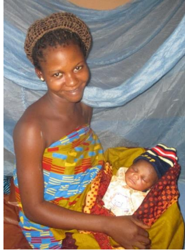
Happy mothers from Elugwu Ettam & Odeligbo