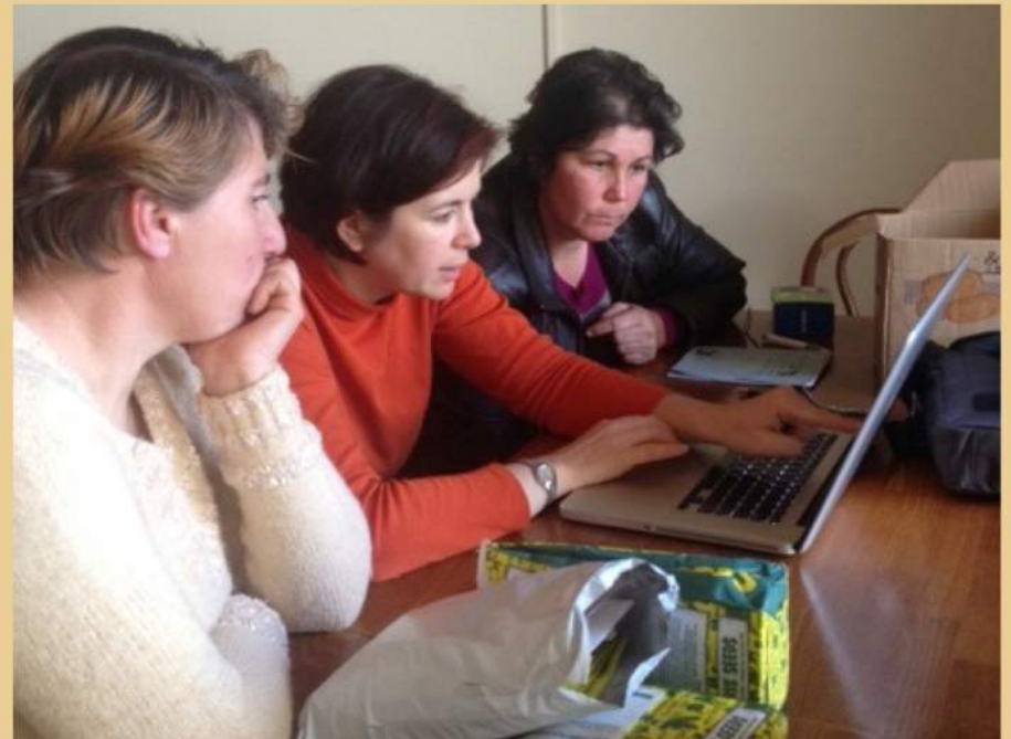
A record blizzard dropped such heavy snows that a new greenhouse collapsed, which was a disappointing setback.