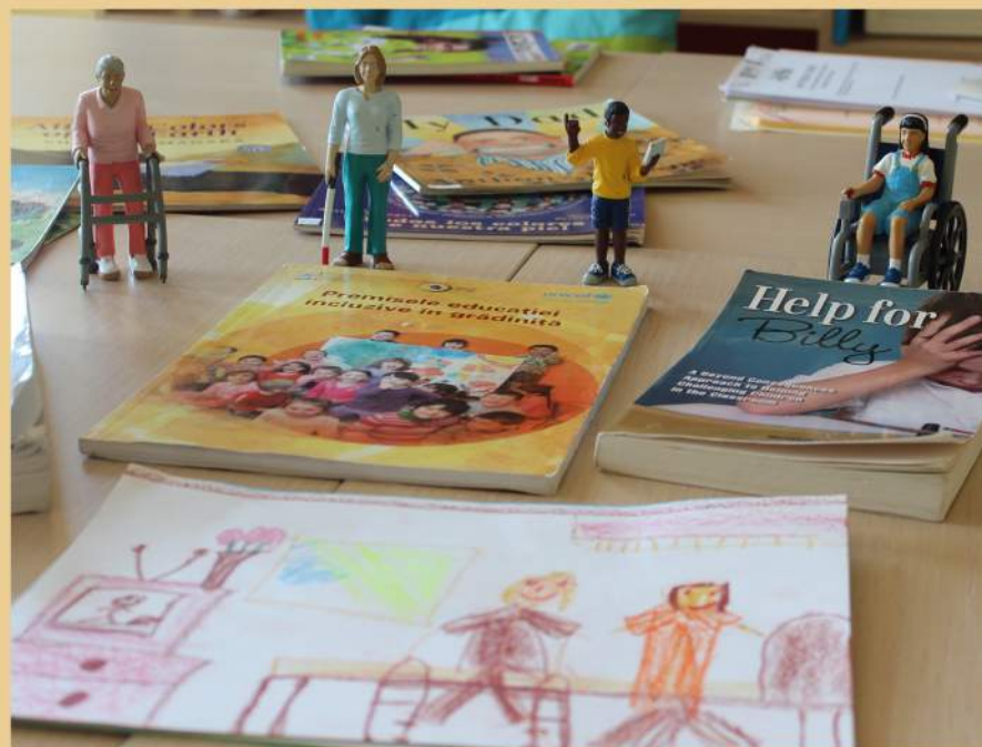
"We all have a story" - training 100 kindergarten teachers in inclusive education - a project that will last 2 years.