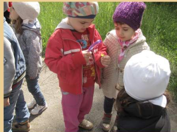
Our Neohumanist kindergarten in Bucharest! “Let’s discover the world”, “I love” and “I can help” are our core themes!