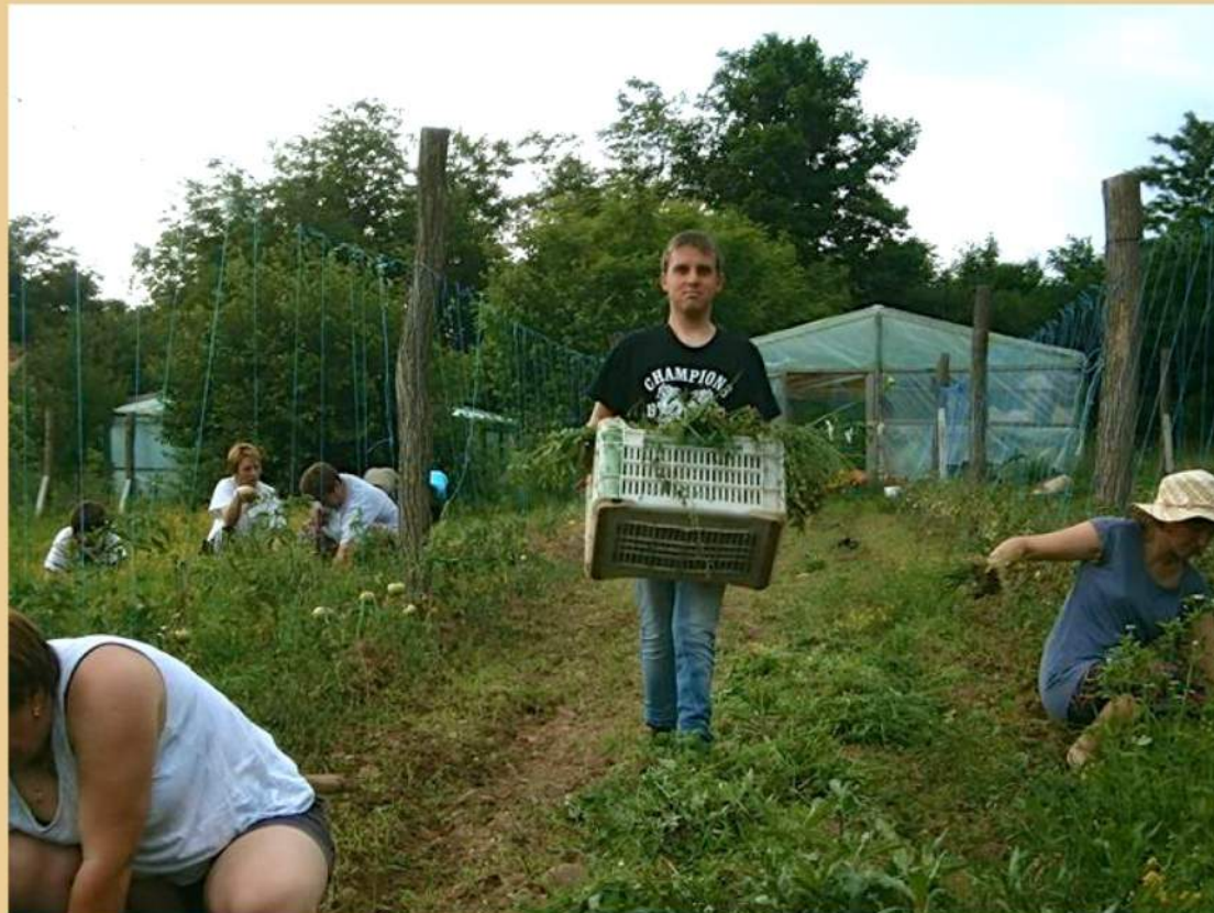
The young adults from the Vistara program working at the farm together with volunteers and the farm team.