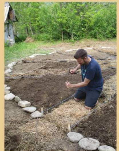
During the national week of volunteering - a group of AMURTEL volunteers created a medicinal herb mandala at the farm! 21