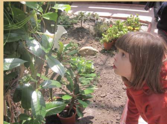
A special earth day experience with a nature elf looking for a lost fairy!