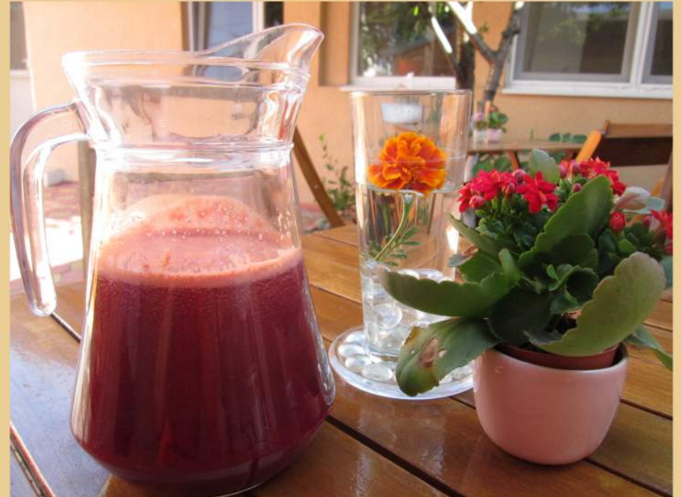
One of our first juice detox programs at Morningstar.