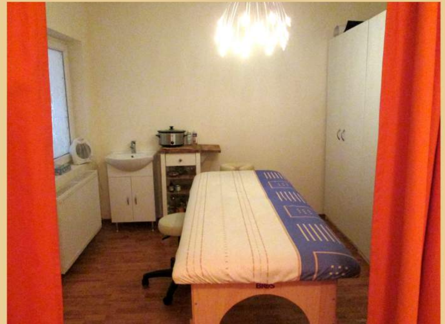
The Morningstar Center opened in the summer of 2014, and includes massage therapy, ayurveda, yoga, meditation and qigong.