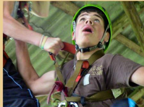
The adventure this year included two overnights in the wilderness, as well as cooperative and challenging exercises in the ropes course.