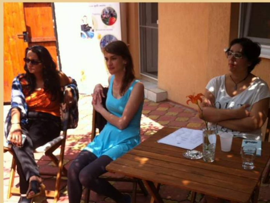
A glimpse of some of our teams behind the scenes that make it all happen!