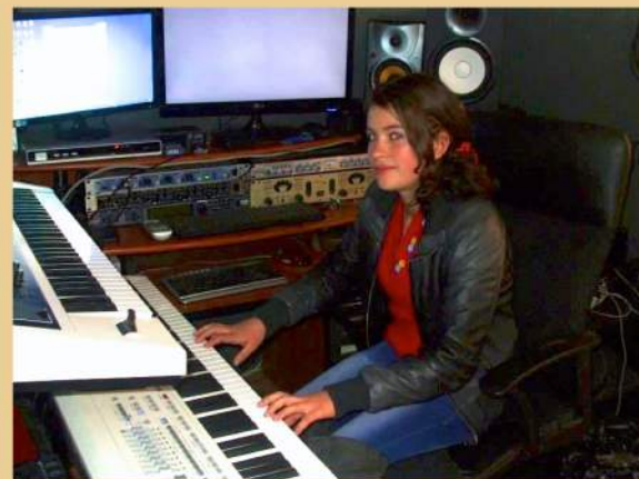
"Passing the Torch" a project funded by "Terre des Hommes"- the kids from Fountain of Hope got to try out adult jobs for a day!