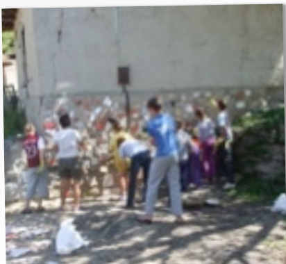
CLUB TIP CHILDREN MAKE A MOSAIC WITH BROKEN TILES

In order to increase empathy and service spirit, the children prepared a meal for the elderly people in the community. They bought the food with the money they raised during a disco night they organized with music and dancing for other kids their age (just like the big ones!). After they cooked lunch and put it in containers, they went to the elderly people's homes and gave them the food. The joy on the faces of the elderly while receiving the food, their tears and good wishes were very rewarding for the youngsters.