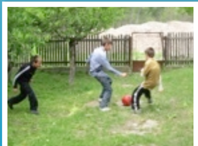
SPORTS AND GAMES