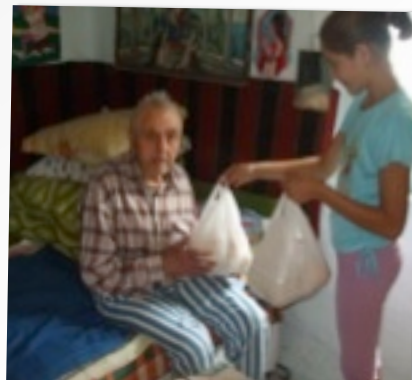
CHILDREN FROM CLUB TIP BRING FOOD TO THE ELDERLY