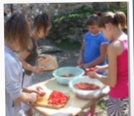
THEY ALSO HELPED PREPARE GARDEN VEGETABLES FOR WINTER