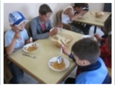
FREE HOT MEALS