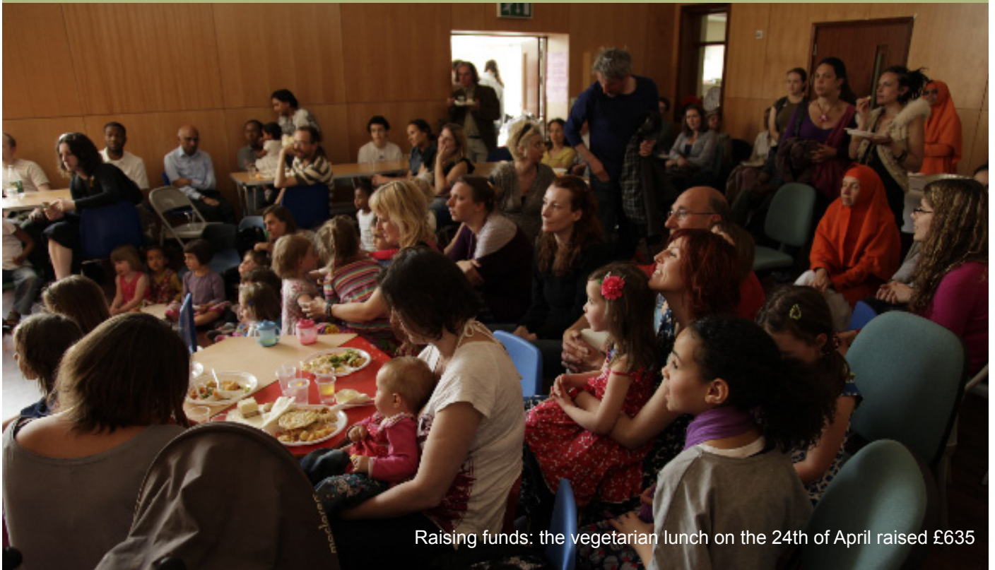
Raising funds: the vegetarian lunch on the 24th of April raised £635