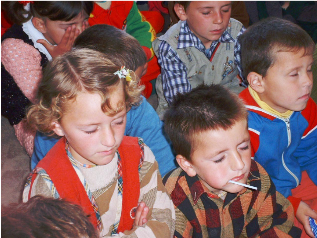
Children doing meditation at the Albanian Sunrise Nursery

one of your local schools and ask if they are interested in doing yoga or meditation. Sunrise schools are always the best places to start, the best places to learn. Not every child can come to Sunrise schools, and hopefully through this way we can let the ideology of neo-humanism spread further and further. Baba Nam Kevalam.