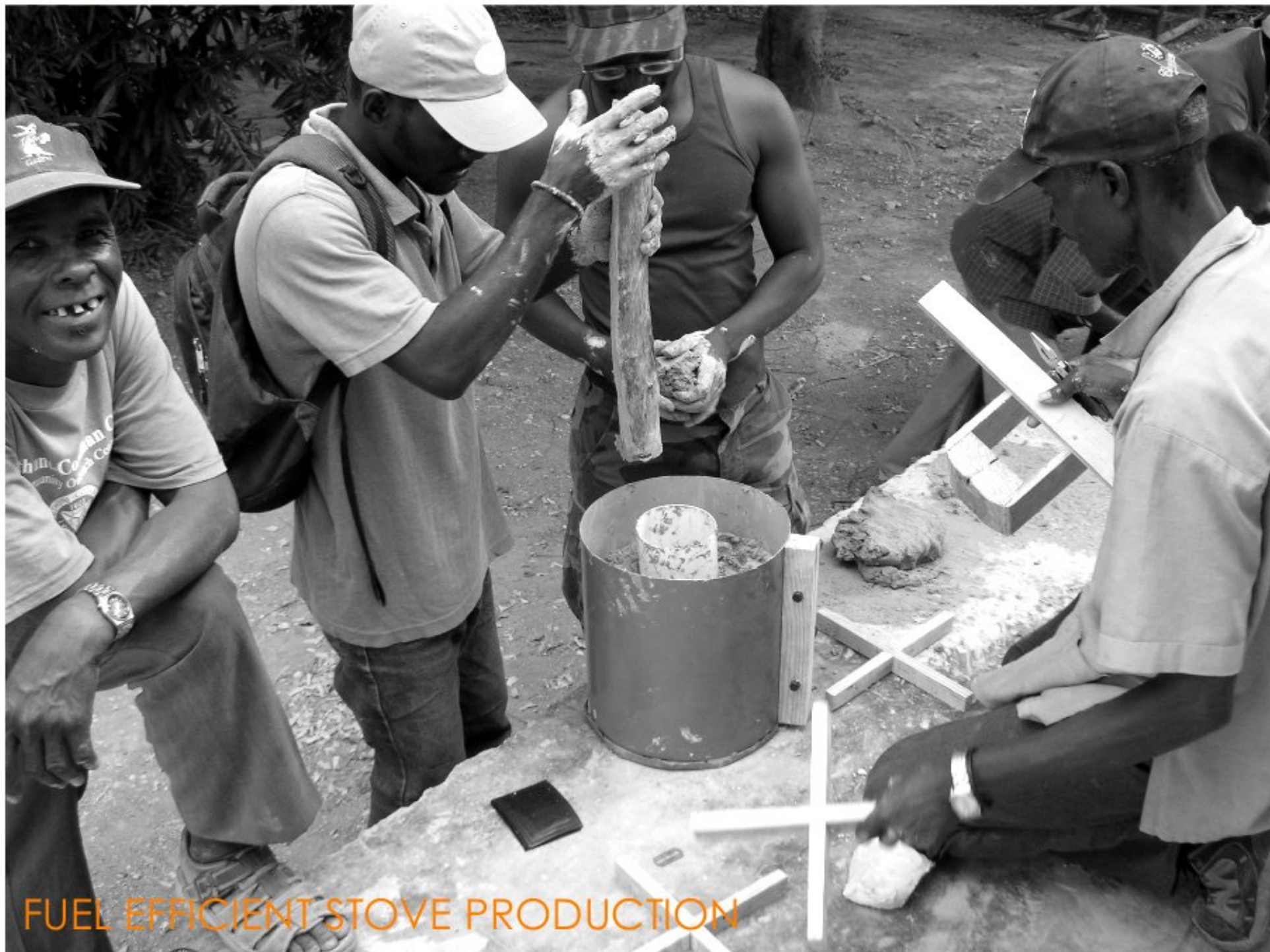
FUEL EFFICIENT STOVE PRODUCTION