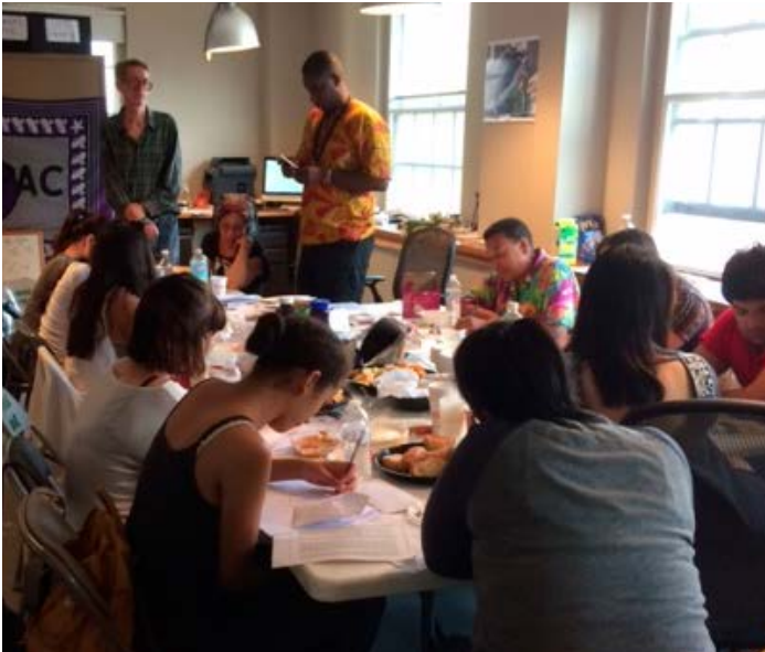
WESPAC members with students writing letters to prisoners.

INSIDE: Reviews News Poetry Cooperative Leadership Women and Their Rights