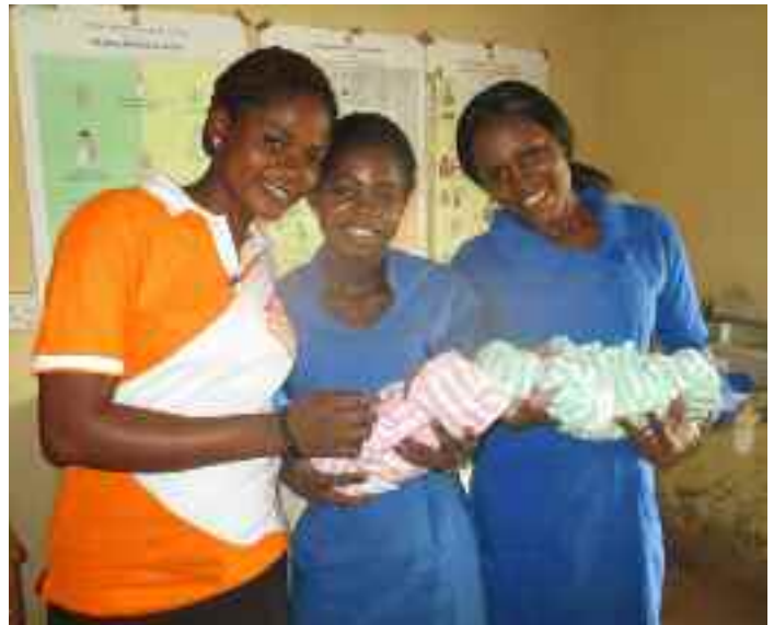
Good prenatal education leads to successful births.

The maternal health promoters have grown into a dynamic grassroots network for health promotion.