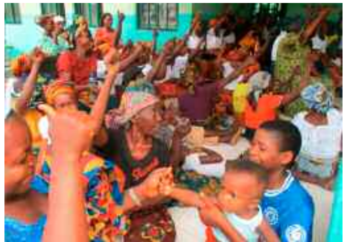
Successful families thrive in a community of health education and support,

The AMURT primary healthcare program in Ebonyi State now has a staff of over 160, including seven doctors, three laboratory scientists, nine midwives, and 120 health workers in the village health centers. We have 13 vehicles, including five ambulances. Odeligbo Health Center was upgraded to a Comprehensive Emergency Obstetric and Newborn Care Center, and has already done 45 cesarean sections. There are plans for upgrading two more centers in 2018.