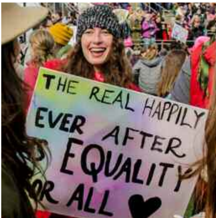
2018 Asheville Women's March

More Inside: UN Urban Agenda Healing from Within Health Care in Nigeria Cooperative Leadership