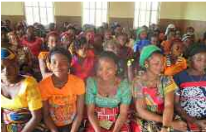
Training for Maternal Health Promoters

The growth of the program can be attributed to the strategy of community mobilization and participation, made possible through local capacity building and intensive and extensive health education campaigns.