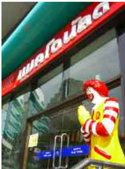
A MacDonald's in Thailand.

Still, one must fight against it at every step. Becoming aware, becoming active in fighting the causes of exploitation and sharing that awareness with others is probably the only practical solution.