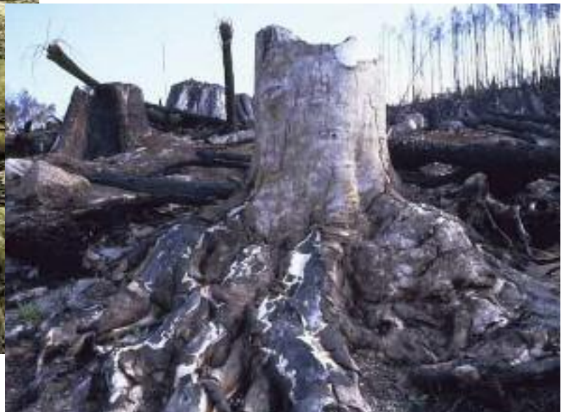
Before and after subsidized logging in Tasmania.