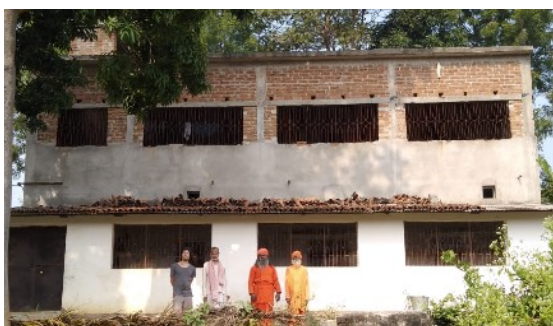
Constructing another village school Asiimananda