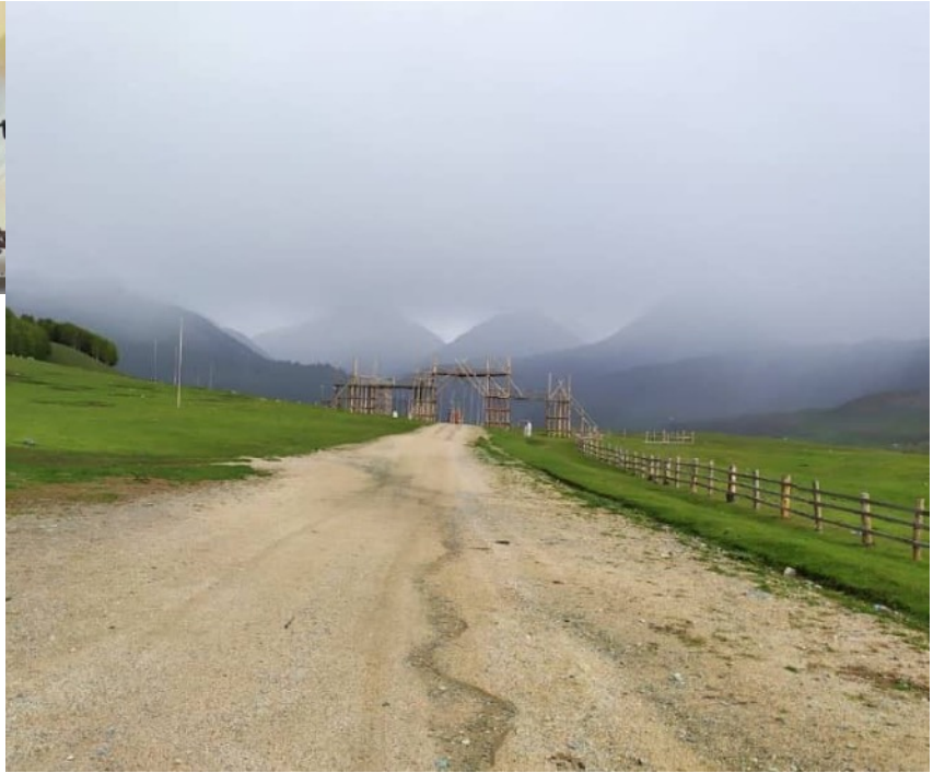
Road Leading to Issyl Kul Lake Resort

The beautiful location, devotional Kiirtans, loving Margiis, excellent RAWA performances, clean air and delicious food made it one of our best Sectorial Conferences ever.