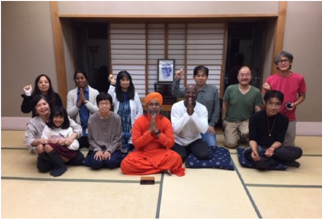
10 Margiis Enjoyed SS Dada's Seminar Class in Tokyo