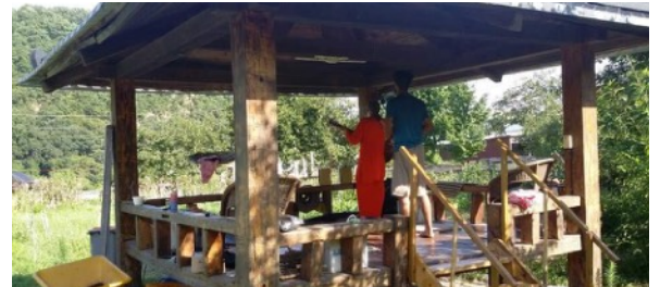
Module 7 was held on August 10-11 weekend.

Our intermediate level Advanced Yoga Camp completed Modules 6 and 7 with twelve and six attendees respectively. The two year course will finish with the last module in mid-December.