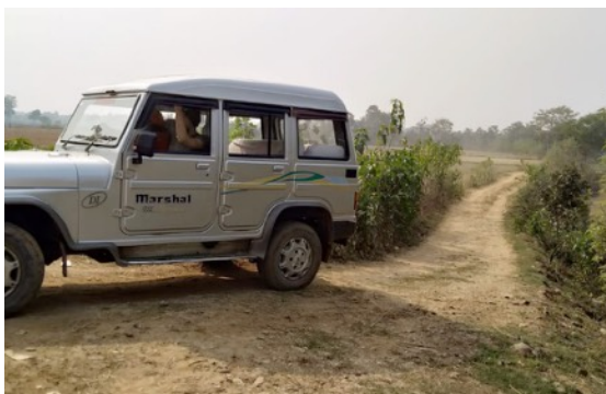
Constructing road to the village school Asiimananda