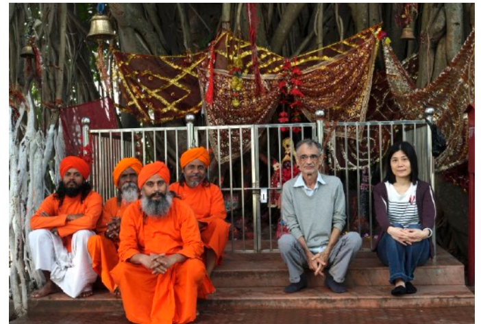
Taiwan margiis visiting the land