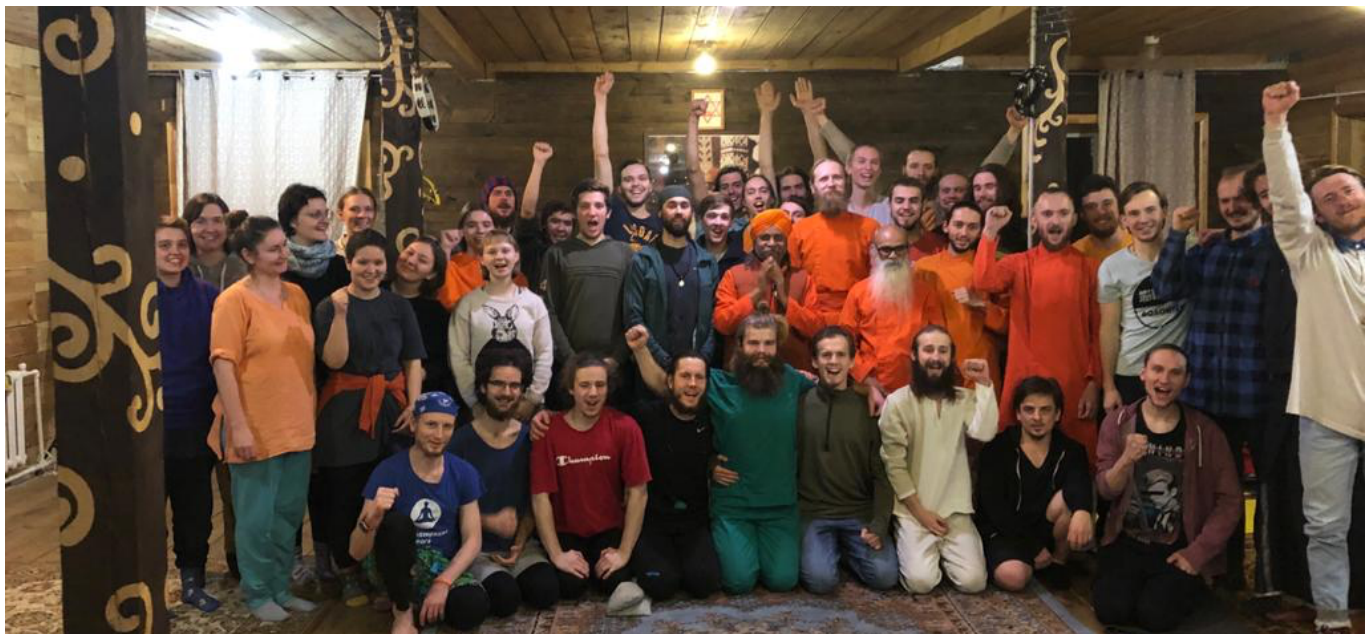
28 brothers and 10 sisters from Russia passed LFT training