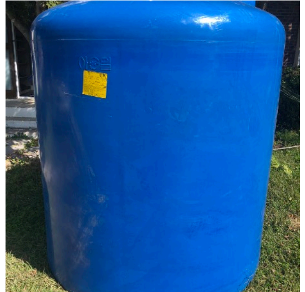
10,000 Liter water tank