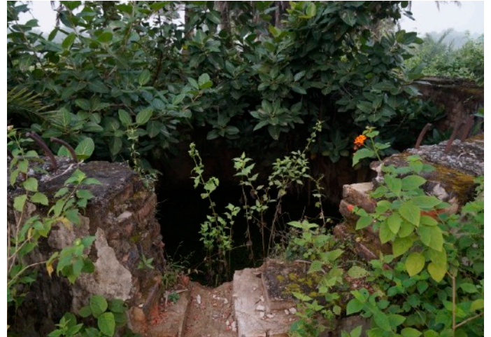
Land purchase with well