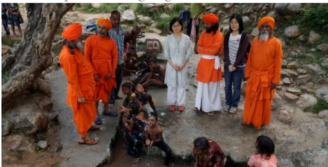
Land with hot spring we are planning to purchase