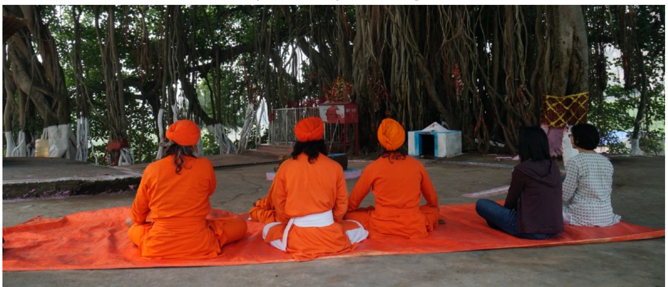
Meditating at the Tantra Piita in Ananda Sambhuti