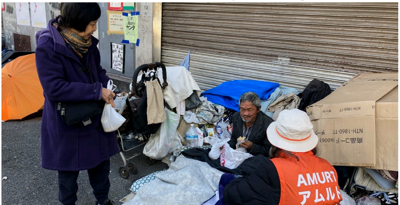
Daily Sadavrata by AMURT Japan