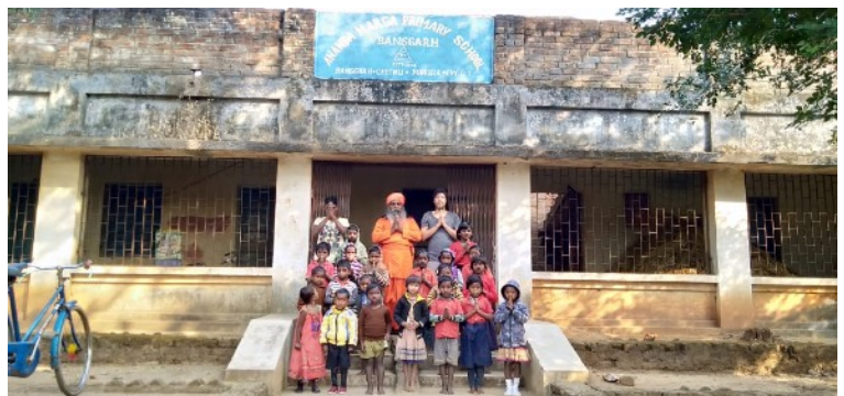
Bash Gar Ananda Nagar school