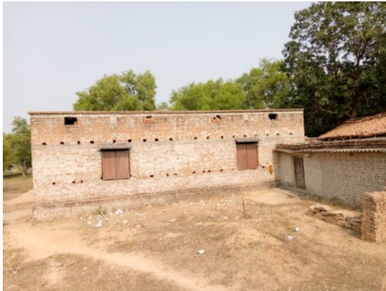
School in Hathi Nada

For many years, Hong Kong Sector has been supporting in different ways the different school projects in Ananda Nagar through the Ananda Marga Foundation in Taiwan. The support is in the areas like the salaries of the teachers, to the maintenance of the buildings and when there is a bigger sum of funds it will be used for the construction of buildings to be used as schools. In total 600-700 students receives free education and monthly 1,000 - 1,200 USD are spent on this project which is supervised by RM Dada Ac Anirvanananda Avt