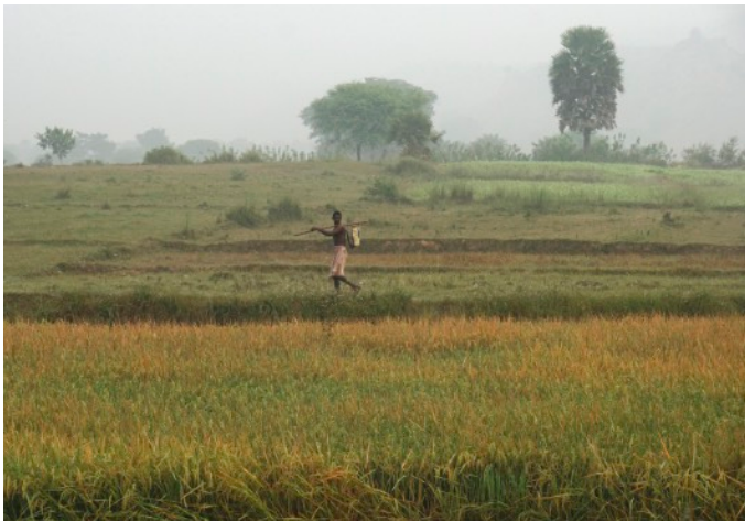
We are in process of signing contract for this rice field