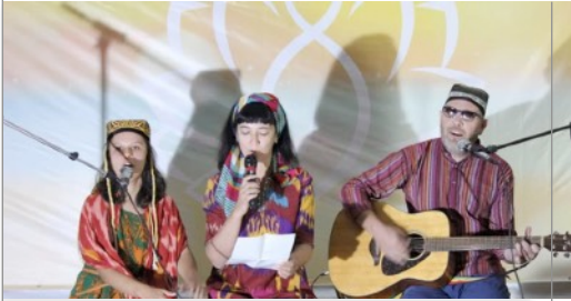
Traditional Kazak Folk Song