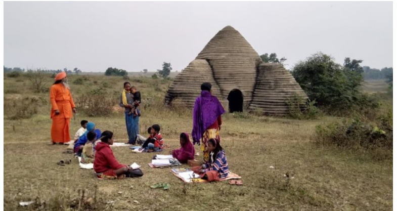
School in Malka