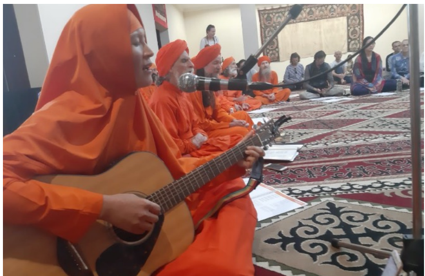
Celebrating Prabhat Sangiita Day

The beautiful location, devotional Kiirtans, loving Margiis, excellent RAWA performances, clean air and delicious food made it one of our best Sectorial Conferences ever.