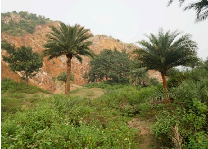
Recent land purchased

In the past few months, SS Dada HKS has went around different states to inspire margiis and sympathiser to contribute to the project. Many margiis from overseas and locally has visited the place. We have currently signed a contract to purchase another 10 Arce land and would be signing another few lands within the next 1-2 months in which one consist of a hot spring.