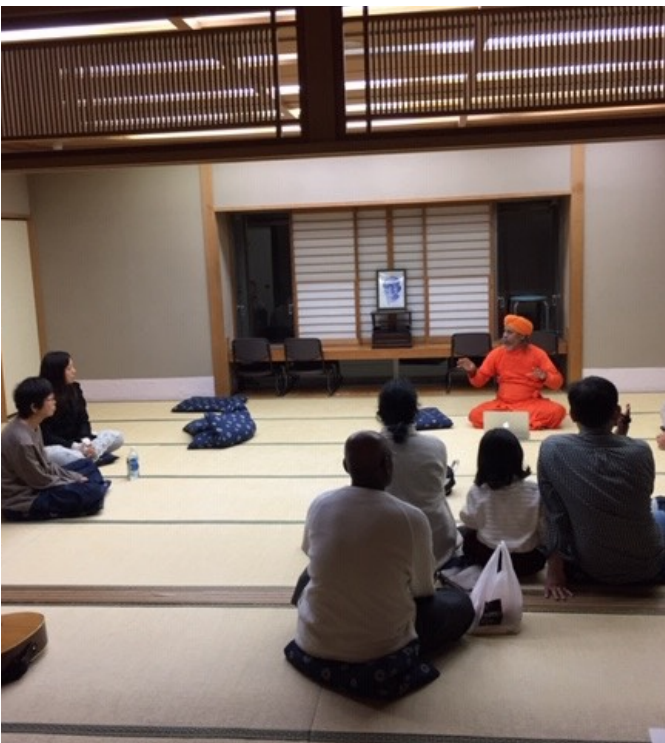
SS Dada could also inspire Margiis at their monthly Tokyo gathering